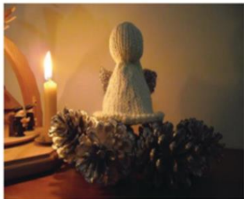
This angel is knitted in sparkly cream, with sparkly mohair wings.