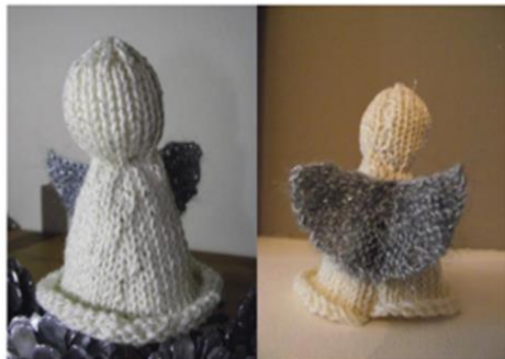
Wings as they should look using option 2.